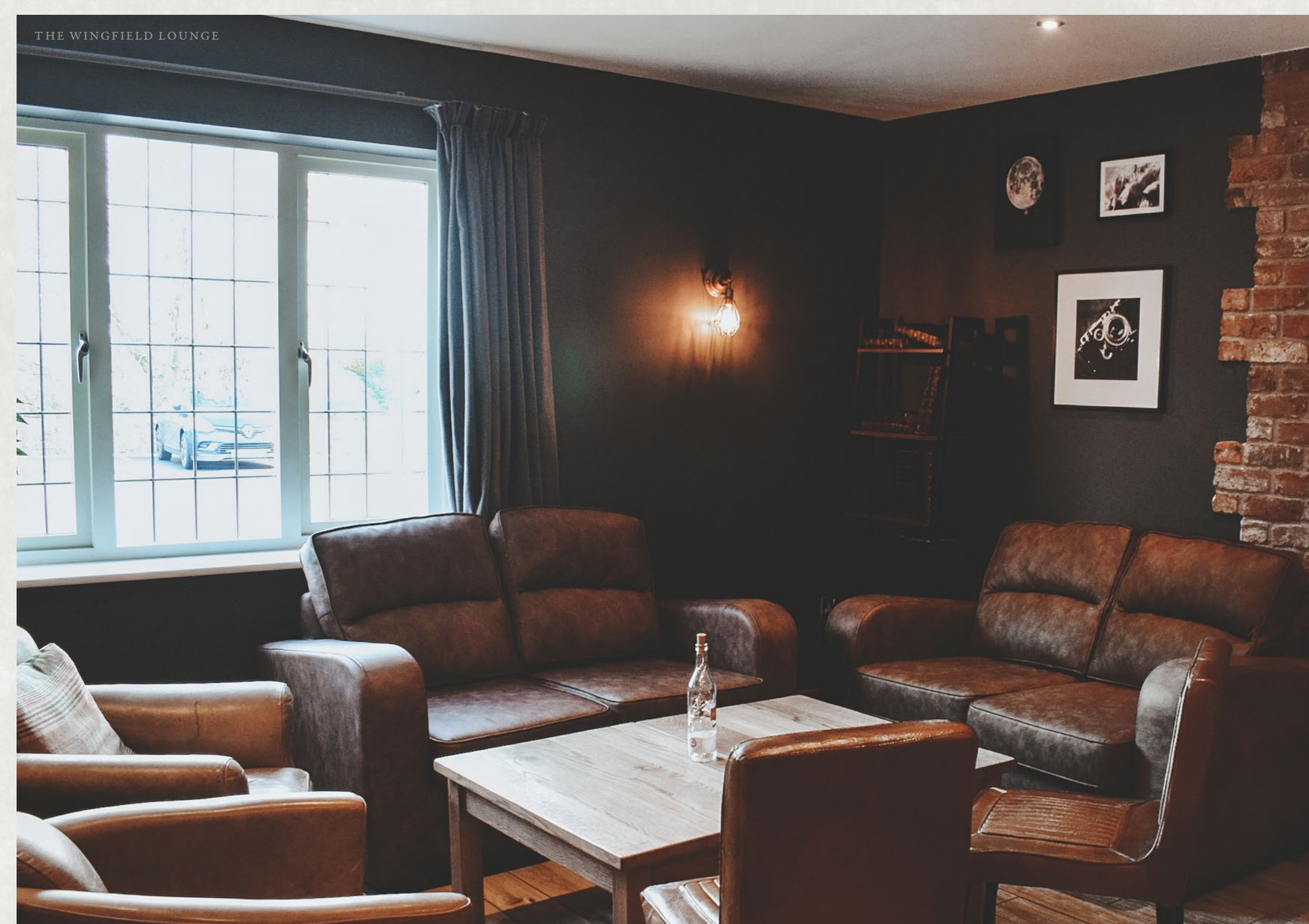
THE WINGFIELD LOUNGE